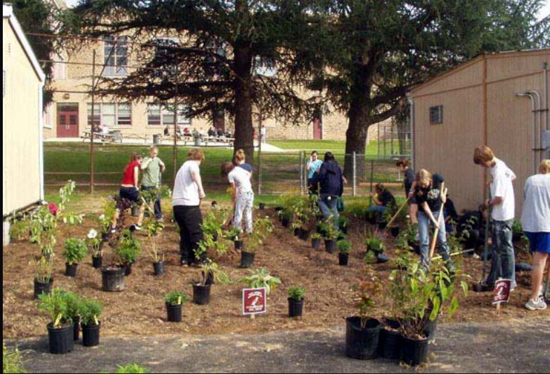
Baltimore County students plant a rain garden to prevent erosion.