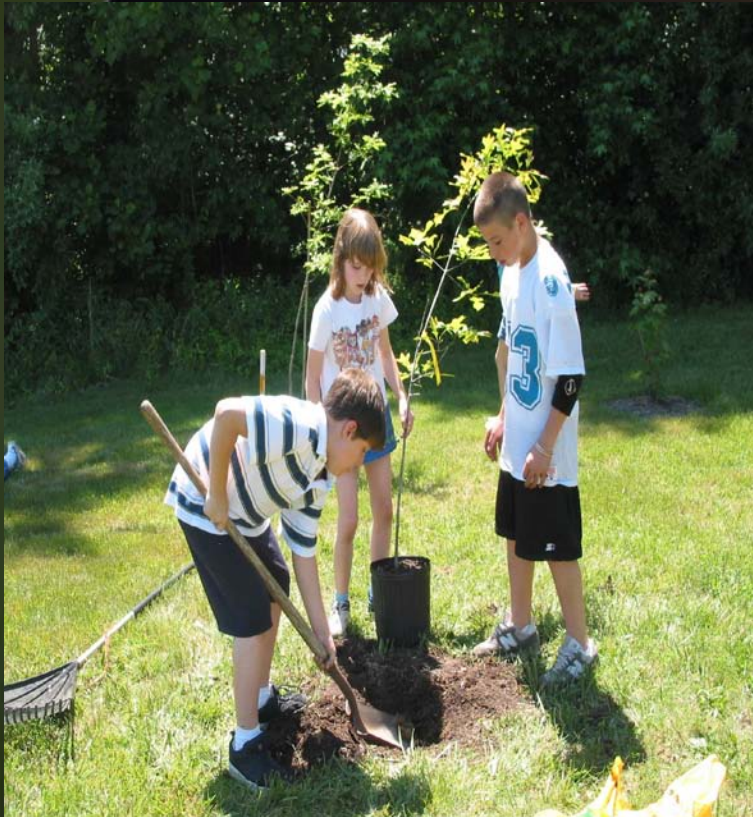
St. Mary's County students plant trees as part of reforestation project.

“Through service-learning, students have unique opportunities to learn the value of teamwork and build critical thinking skills while completing service projects in areas such as education, public safety and the environment. Studies have shown that students who participate in such programs demonstrate increased civic and social responsibility and improved academic achievement.”