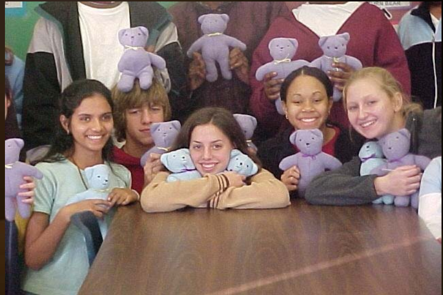
Wicomico County students create bears for children in the hospital.